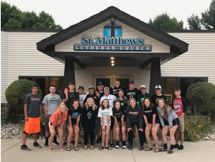
The LYO crew from Sept 13!