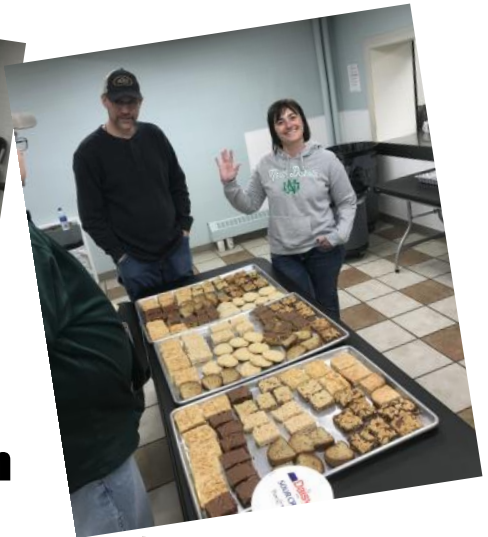
Serving a meal at Northland Rescue Mission