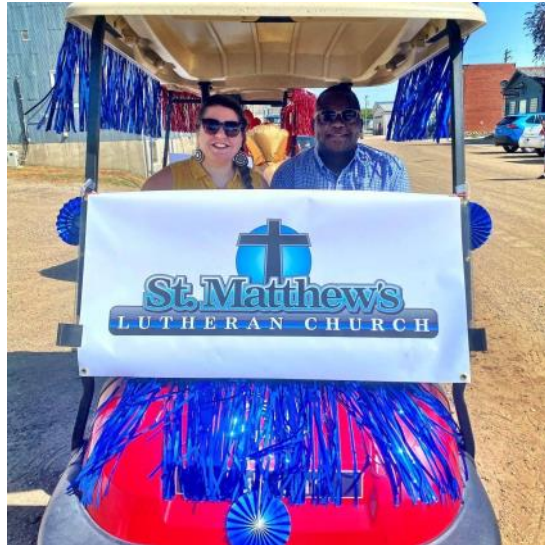
Thompson Days Parade