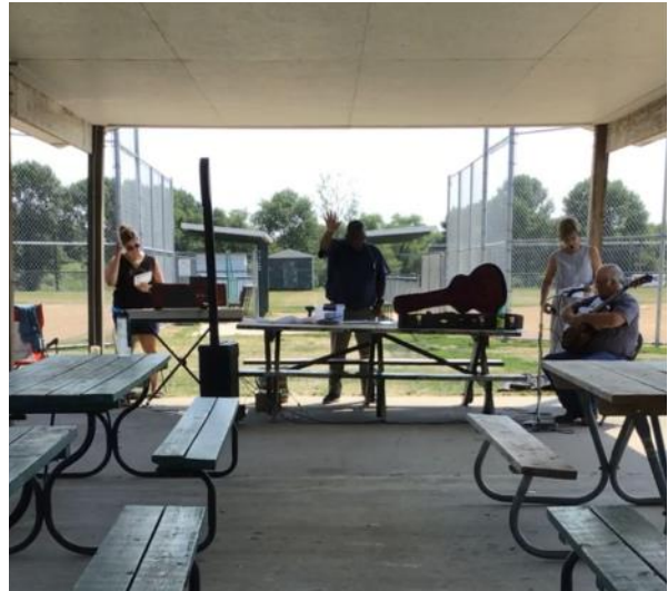
Community Worship Service Thompson Days